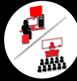
Hybrid (Face-to-Face + Online)