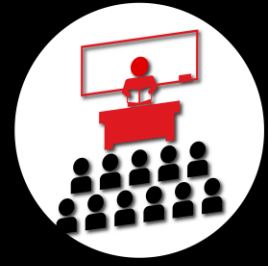
Face-to-Face (On Ground)