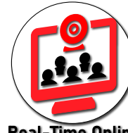
Real-Time Online (Synchronous)

In an online class, all course activity occurs online; there are no required real-time or on campus meetings. All content is delivered in Canvas. Coursework does have due dates as set by the instructor, but can be completed, once the content becomes available, at any time before the due date.