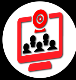
Real-Time Online (Synchronous)