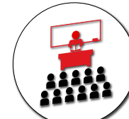
Face-to-Face (On Campus)

In a hybrid class, course activity occurs both online and face-to-face on campus; both the online and face-to-face portion are required. The face-to-face meetings occur on scheduled days and times. All online content is delivered in Canvas and/or zoom. At the start of the semester, a detailed schedule for the term, with face-to-face meetings, will be posted on IVC's syllabi site and in Canvas.