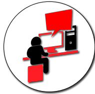
Traditional Online (Asynchronous)

In an online class, all course activity occurs online; there are no required real-time or on campus meetings. All content is delivered in Canvas. Coursework does have due dates as set by the instructor, but can be completed, once the content becomes available, at any time before the due date.