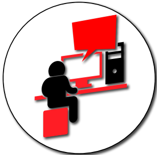
Traditional Online (Asynchronous)

In an online class, all course activity occurs online; there are no required real-time or on-campus meetings. All content is delivered in Canvas. Coursework does have due dates as set by the instructor, but can be completed at any time before the due date according to an individual student's schedule. Quizzes or tests may have a shortened period (usually a week's time) during which students will need to complete them.