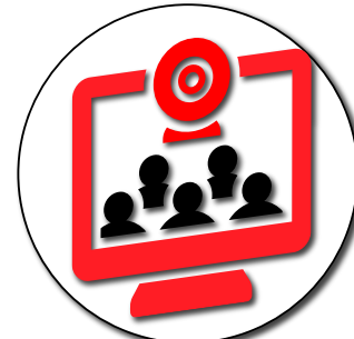
Real-Time Online (Synchronous)

In an online class, all course activity occurs online; there are no required real-time or on-campus meetings. All content is delivered in Canvas. Coursework does have due dates as set by the instructor, but can be completed at any time before the due date according to an individual student's schedule. Quizzes or tests may have a shortened period (usually a week's time) during which students will need to complete them.