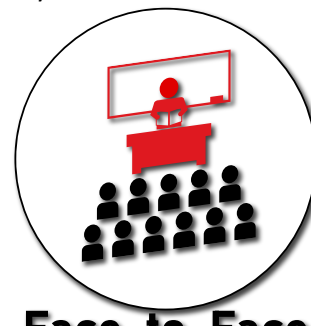
Face-to-Face (On Campus)

In a hybrid class, course activity occurs both online and face-to-face on-campus; both the online and on-campus portion are required. The on-campus meetings occur at scheduled days and times. All online content is delivered in Canvas and Zoom.