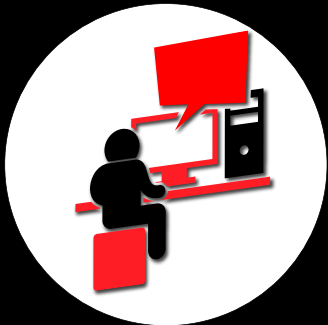
Traditional Online (Asynchronous)