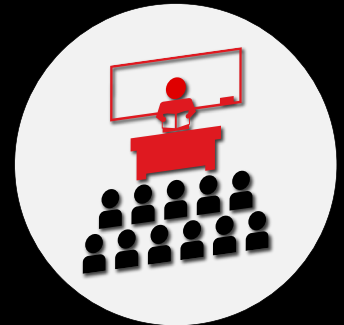
Face-to-Face (On Campus)