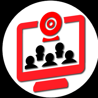
Real-Time Online (Synchronous)