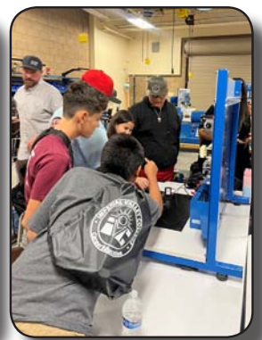
On November 12th & 13th, IVC held the ICOE Migrant Education Program: Path to Higher Education.

Middle and high school students attended presentations showcasing the resources available at IVC and engaged in hands-on activities across various disciplines, including: