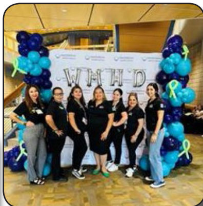
The Student Health Center in collaboration with Imperial County Behavioral Health Services hosted the 7th annual World Mental Health Day Summit on October 11th, with over 150 attendees.