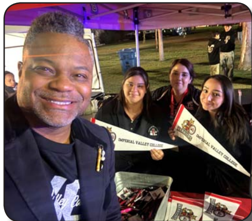
IVC's SEA Outreach Team helps recruit future students at Brawley's Cattle Call Mariachi Night.