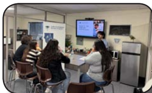
UCSD California Scholars School of Medicine presented at MESA Center to future doctors.