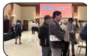
MESA Pre-engineering students attended SDSU Research Symposium.