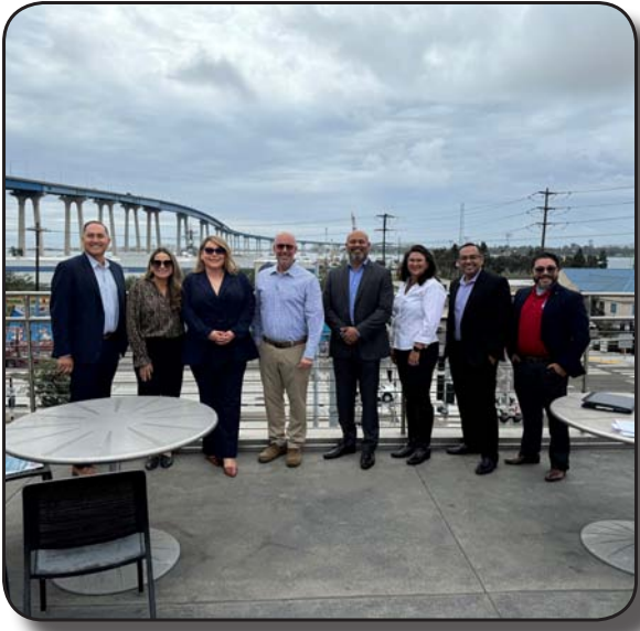
On Oct. 28th, IVC Administration Team visited the San Diego College of Continuation Education to learn about their noncredit program.