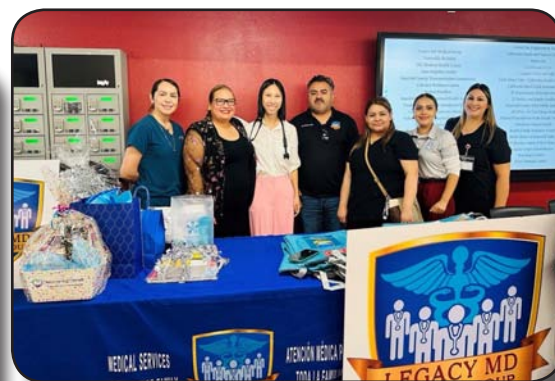
The IVC Student Health Fair in collaboration with Legacy MD Medical Group took place on October 15th and had an attendance of over 100 students who received wellness resources from local community agencies. Over 60 students and staff received the flu vaccine during the event.