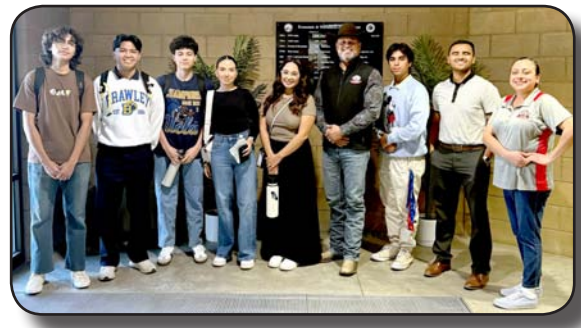
6 Early College Credit Ambassadors have been hired. ECC Ambassadors were past participants in Dual Enrollment and/or Credit By Exam and will be working at their respective high schools. Funded by Regional SWP