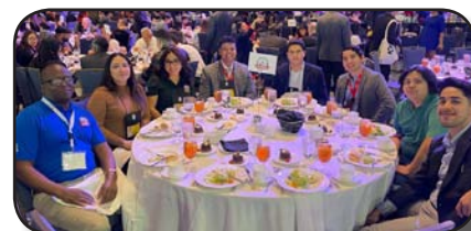
Three MESA students along with IVC Ag students attended the HACU student leadership conference, the three MESA students were sponsored by USDA.