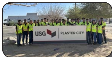
MESA Engineering field trip to USG followed by a meet and greet lunch with USG engineers and HR staff.