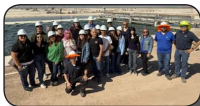
MESA and the Chemistry Club visited Earthrise Nutritionals for a facility process tour, followed by a meet and greet lunch with staff.