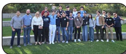
The IVC Empower Scholars visited the School of Engineering at UCSD, where they interacted with faculty members and current engineering students.