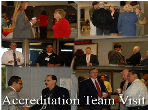
Accreditation Team Visit

On Wednesday, October 8 th the Board of Trustees will hold a Special Board Meeting at 6:00 p.m. in the Board Room. The purpose of the meeting is to review and approve the first of two progress reports required to move IVC off of "accreditation warning" status. Assuming a successful progress report this year, followed by a campus visit, and another report in October of 2009, the "Warning" status should be removed.